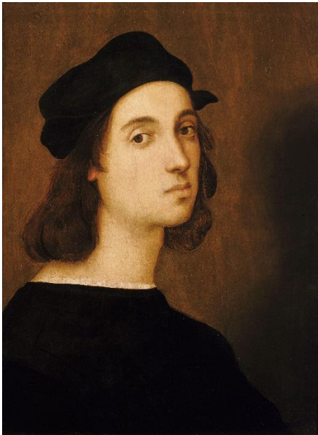
CASA RAFFAELLO — RAPHAEL'S HOUSE IN URBINO

Read this short biography of Raphael Sanzio taken from a guidebook to Urbino